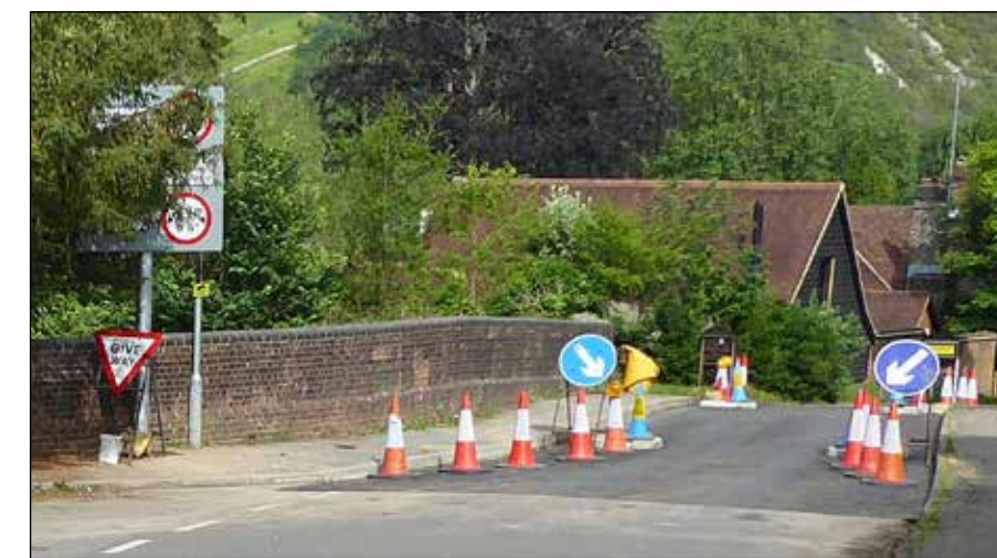
Photograph taken on 2 nd July when bridge was temporarily opened. Note: newly-erected sign instructing drivers to give way to on-coming traffic is obscured by tree branch.