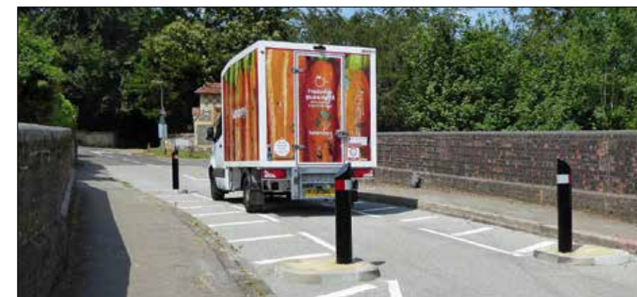
Finished bridge work to limit size of load on bridge until it can be repaired. 23 rd July