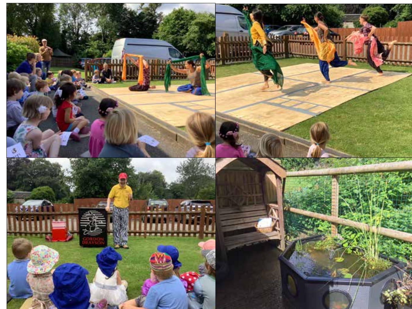
Our end of term entertainment and our quiet area (bottom right)