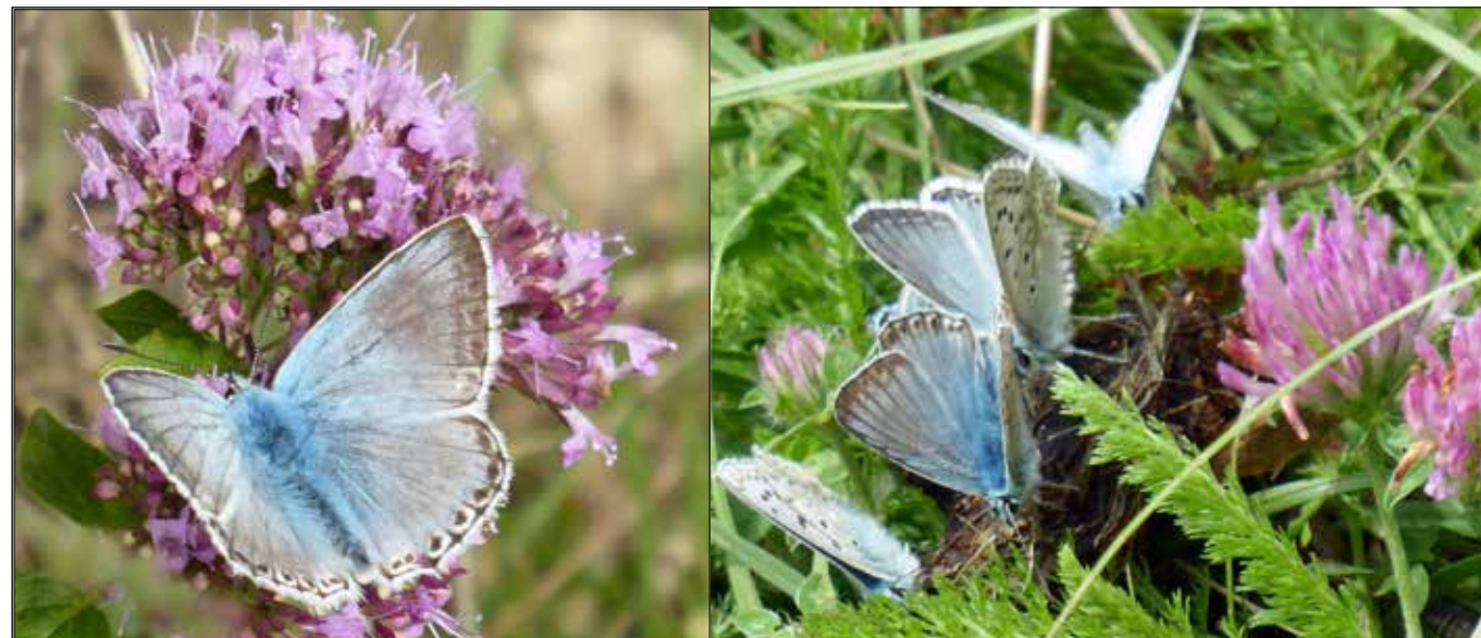
Chalkhill Blue Butterflies on Denbies Hillside - 14 th August