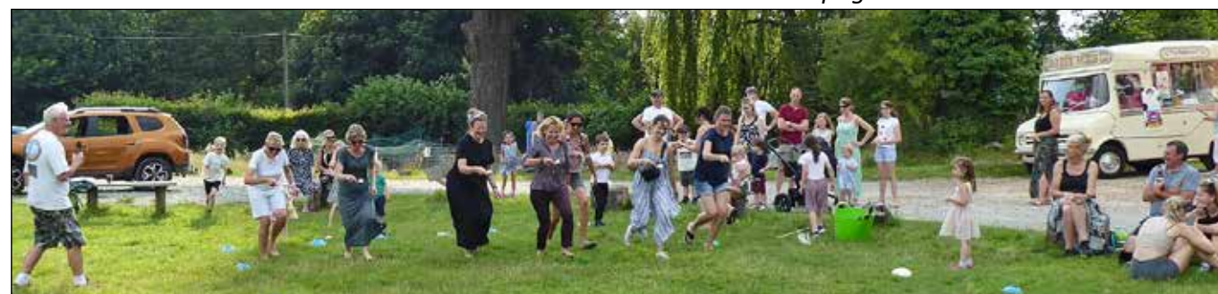
Ladies' egg and spoon race at the summer picnic

The solution to last month's crossword is on page 26.